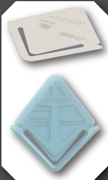
Available in Plastic & Chipboard Options